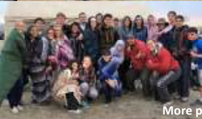
More pix @ https://www.facebook.com/lpcstudent